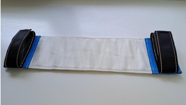
4 Layers Pad Thickness 6,4 mm